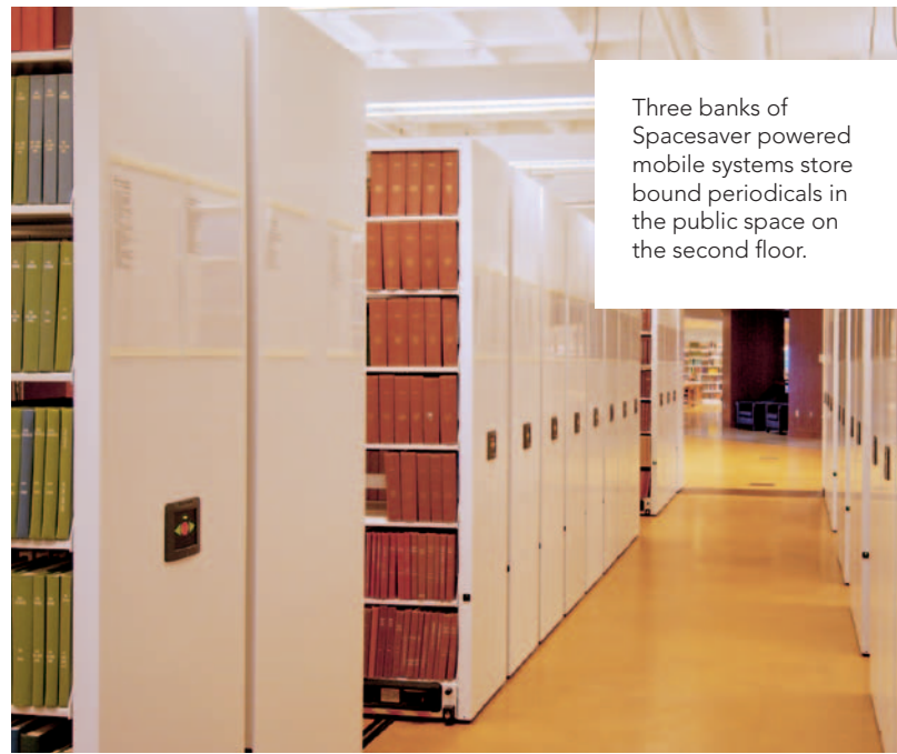
Three banks of Spacesaver powered mobile systems store bound periodicals in the public space on the second floor.

PowerLink® as the monitoring system, assuring optimal operation. Across the floor, some portion of the general book collection is housed in compact shelving and the balance is on stationary shelving.